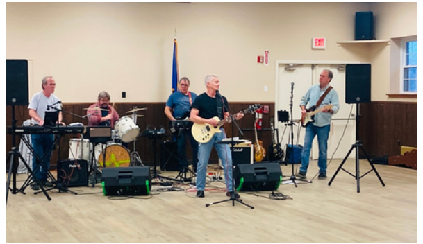
BEATS PER MINUTE